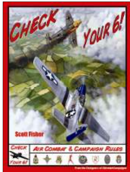
SC03-001 Retails $30.00