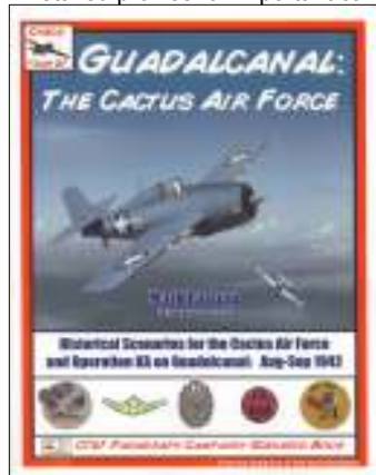
SC04-002 Retails $25.00