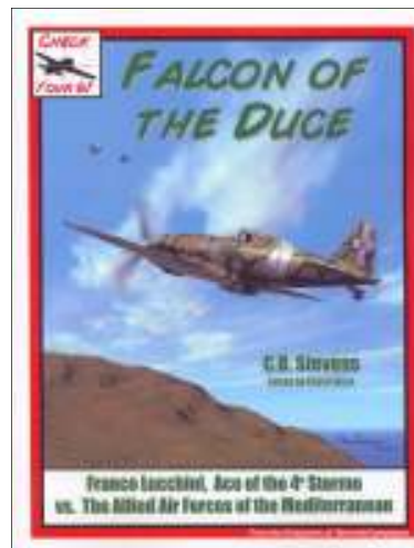
SC04-003 Retails $25.00